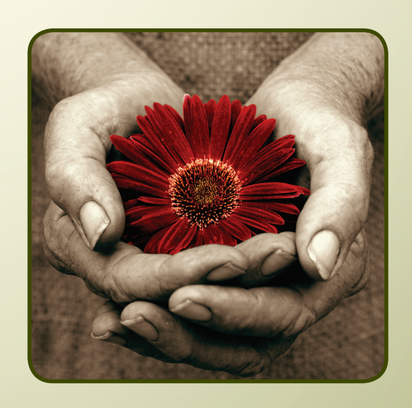
Senior Living with Assistance